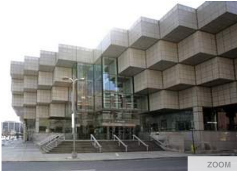
The northeast entrance of Cobo Center is at Washington Boulevard and Congress in Detroit. Operating revenues increased from $3.6 million in fiscal year 2010 to $7.6 million last year.