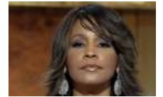
Whitney Houston, 1963-2012