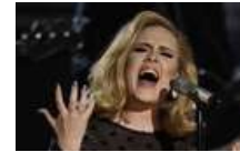
Grammy Awards - winners and performers